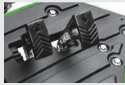
The optional e-Hydro transmission.

With TwinTouch™ pedals, LoadMatch™, to help prevent stalls if the torque load increases on the engine, MotionMatch™, to control how quickly you accelerate or decelerate and a Cruise Control option. Just like in a car.