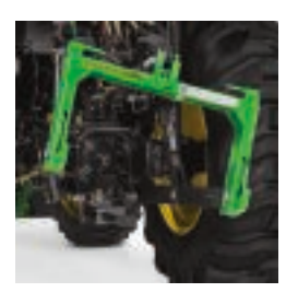
Top And Tilt

Attaches to the back of your 3 Series Tractor and makes hauling and towing a breeze.